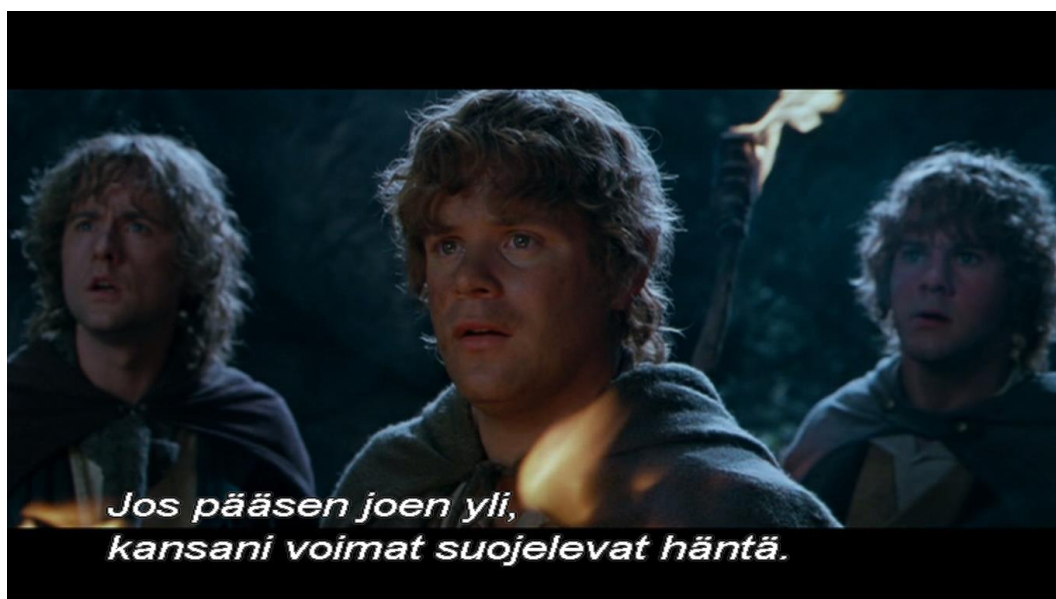
Picture 4. The hobbits listen Strider and Arwen's discussion

When Arwen starts speaking, the image changes from a close up of Pippin to a slightly wider shot that includes also Sam and Merry. As the Picture 4 below illustrates, the core mode image shows Sam, Merry and Pippin's confusion and worry, whereas the core mode language conveys Arwen's Elvish speech. Also in this example the italicized subtitles indicate that the speaker is not in the frame and that the spoken language is not the film's main language English.