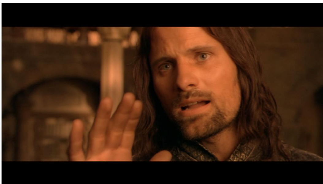
Picture 1. Strider's body language