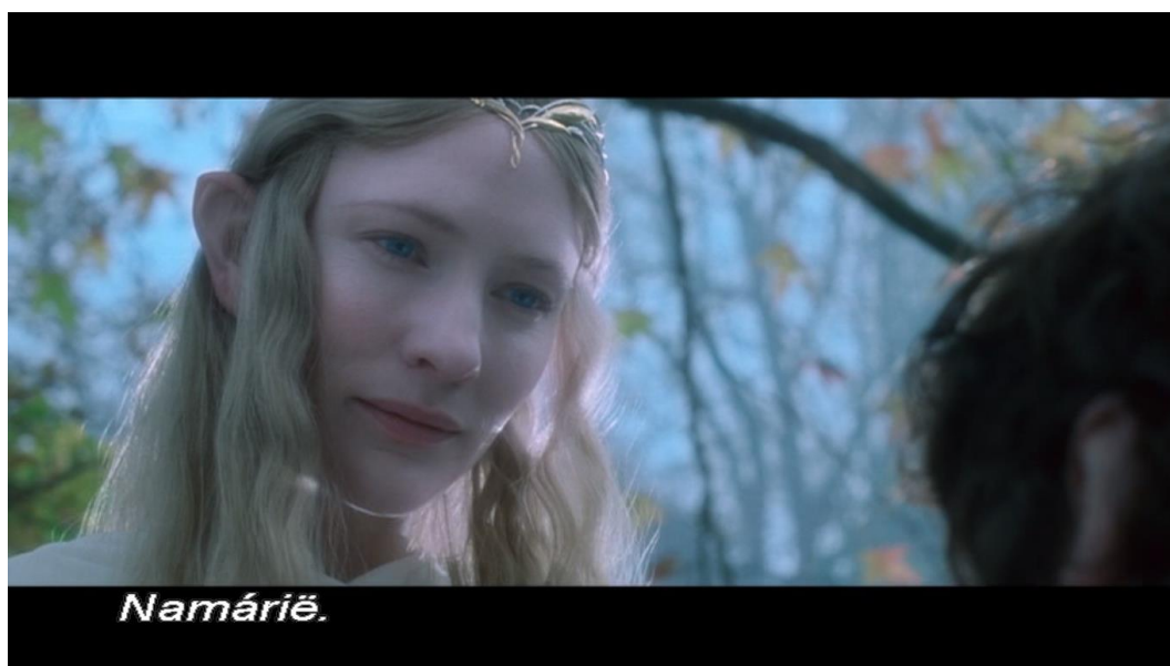
Picture 2. Galadriel and Frodo

Namárië appears in the Finnish subtitles in Elvish, but the word cannot be directly linked to the action on the screen like in the forthcoming example 5, and the meaning of the word is not explained in the dialogue like in example 3. However, in example 3 the dialogue still offered in English, and therefore also Finnish, translation for the word. Interestingly enough, same technique is used also in this case, although it is not as obvious. The English translation is given at the very beginning of Galadriel's line, since namárië means "farewell" in English (Tolkien 1999a: 497; Fempiror). However, it is possible that viewers might not notice this.