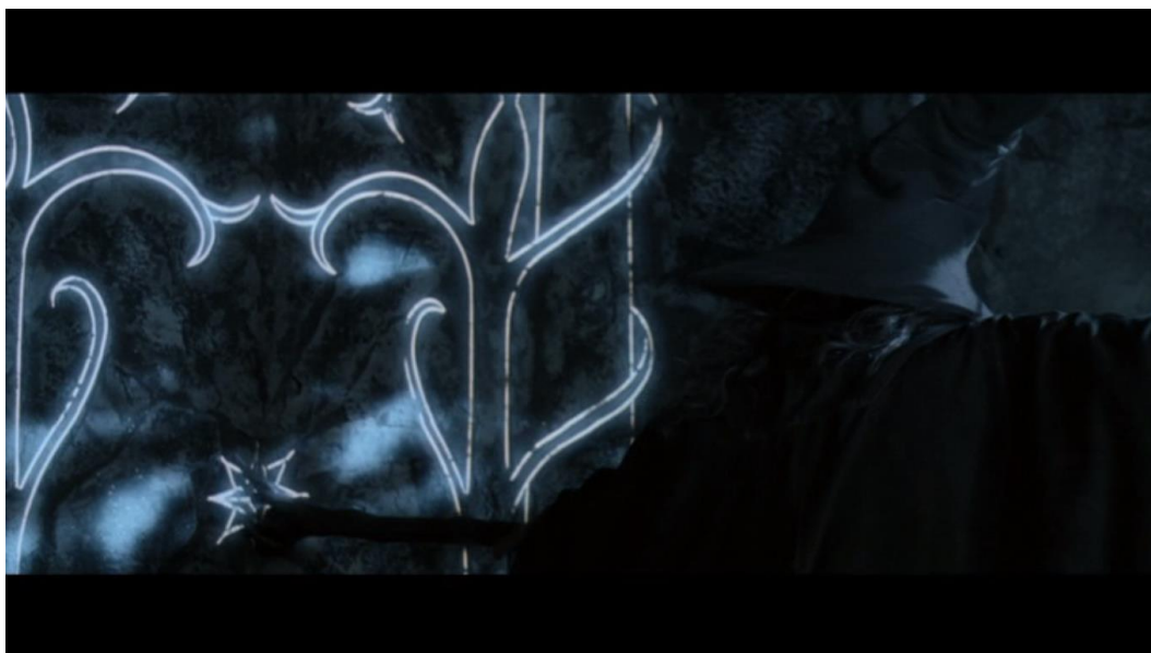
Picture 3. Gandalf’s spell

The English translation of the Elvish line is apparently “Gate of the Elves, open now for me!” (Fempiror). It is an Elvish spell, and like all Elvish spells in the film, it has not been subtitled. However, viewers are made very aware of the fact that it is a spell, which is intended to open the gate. Since this information of the purpose of the spell is conveyed through other modes of the film, the line in example 6 does not have to be subtitled into Finnish. The dialogue before Gandalf’s line already establishes that the gate has to be opened. Then the image (see Picture 3) shows the wizard Gandalf placing the top of his staff against the gate, which is a sign that he is going to perform magic. When Gandalf speaks, his tone of voice is has changed to louder, clearer and more commanding. The image also shows Gimli’s reaction when Gandalf casts the spell: the dwarf appears to be expecting that something happens.