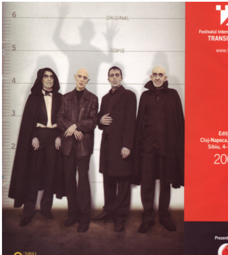
Picture 1. An example of self-projective stereotype: a summer 2007 Transylvanian International Film Festival poster. (A leaflet from the Cinema ‘Arta’, Cluj-Napoca, Romania)

overgeneralizations that are purely self-projective; we project concepts from our own culture onto people of another culture.